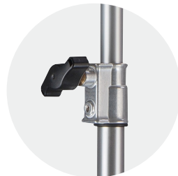
Ergonomic knob use comfortably and lock quickly.