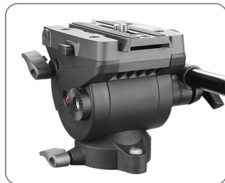
GH04F Fluid head.

E-IMAGE ML-900C new designed monopod with geared center column is extremely solid and wobble free. Geared center column provides extra height if you need to get your camera high up, it can be used on moving shooting and other events, which is easier to use than hand-head. It integrates the monopod, sticks and low profile tripod into one. Easy to get functions switching and it is a great choice for travel and outdoor shooting.