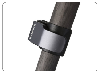
Flip type locking system.