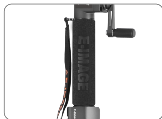
Foam cover on top section of tripods provides a secure and comfortable grip.