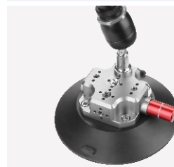
6" pump suction cup with 1/4" & 3/8" receivers can be detached to use seperately. It is made of rubber material with silicon, the cup offers secure mounting on smooth, nonporous surfaces, supports payloads up to 30kg.