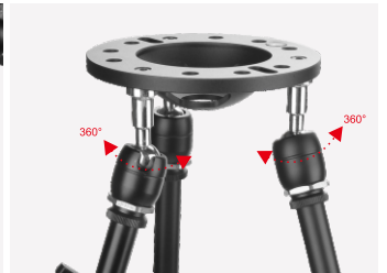
With 360 degree swivel heads at the end of the arms provided you an accurate adjustment when you need any angle of the device.