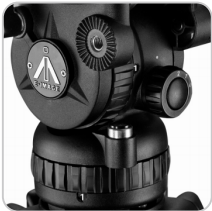
1 plus 0 grades of pan & tilt drag