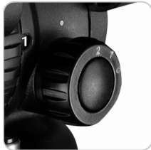
2 plus 0 steps of counterbalance