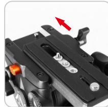
Quick install plate